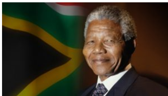
"Mandela – The Journey to Ubuntu" at the Freedom Center

A much-anticipated life appreciation at the Freedom Center of this much-loved and respected figure within the global civil rights movement. Told through photographs by Matthew Willman. Opening night celebration begins at 5 p.m., and includes a world premiere dance performance as part of the Constella Festival. See Music, below. Exhibit runs through Aug. 20.