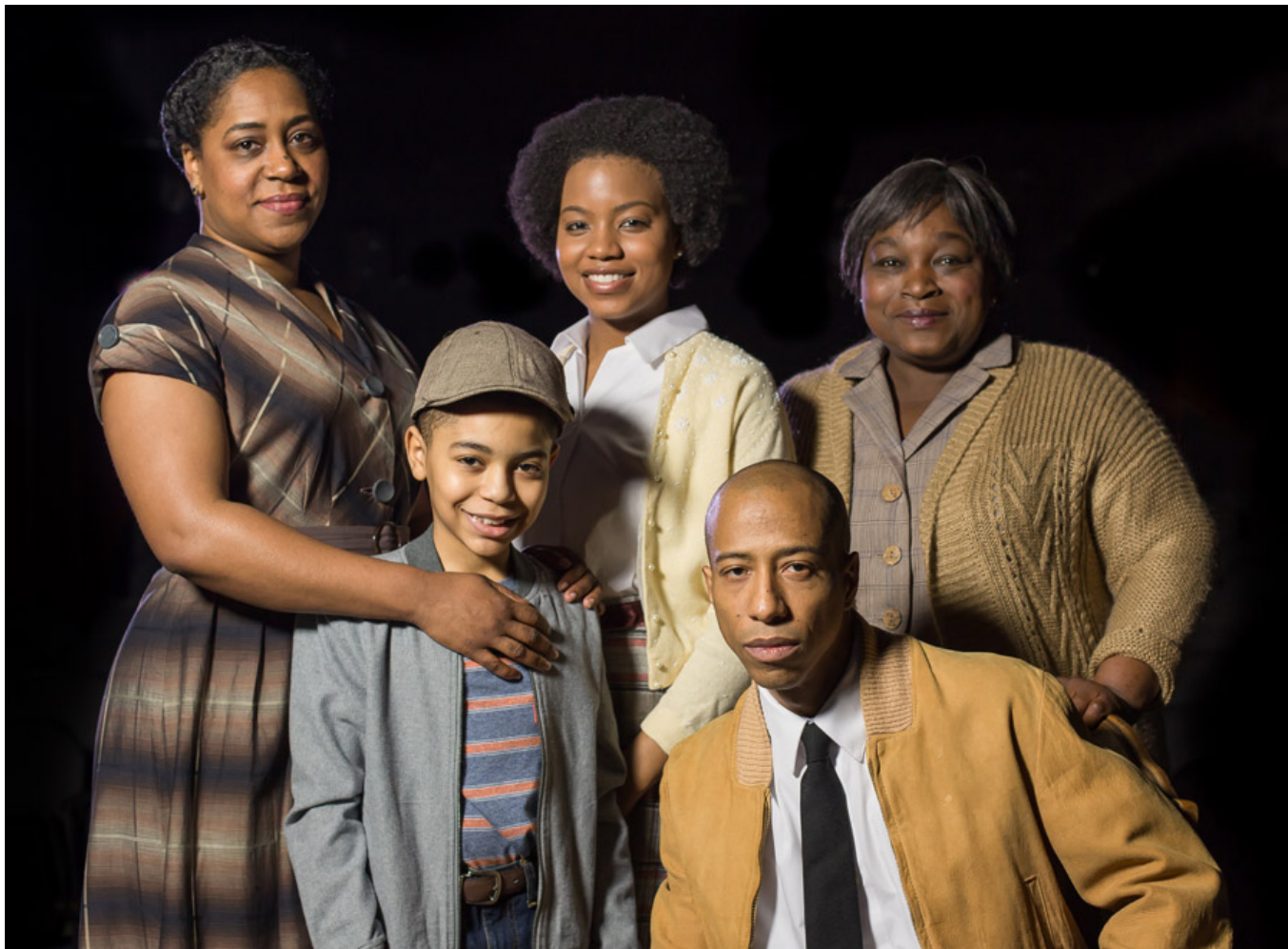
The cast of "Raisin in the Sun" at Cincy Shakes

Cincy Shakes spreads its wings in welcome fashion to present this iconic 1959 play about money and family complications in search of the American Dream.