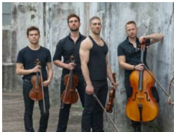
CSO Spectrum hosts Well-Strung at the 20th Century Theater.

The Constella Festival wraps up this weekend with three varied programs incorporating film, dance, visual art, plus a chance to tango and let your own hair down after the finale.