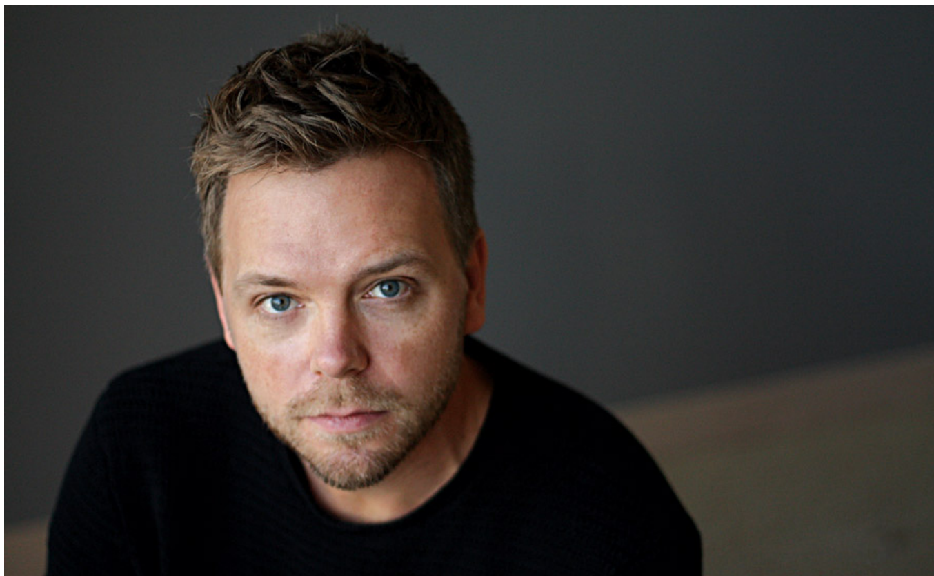
Nathan Hill, author of “The Nix” at the Mercantile Library