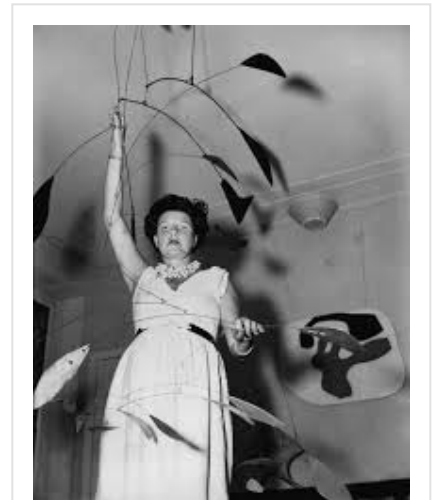
'Peggy Guggenheim: Art Addict'