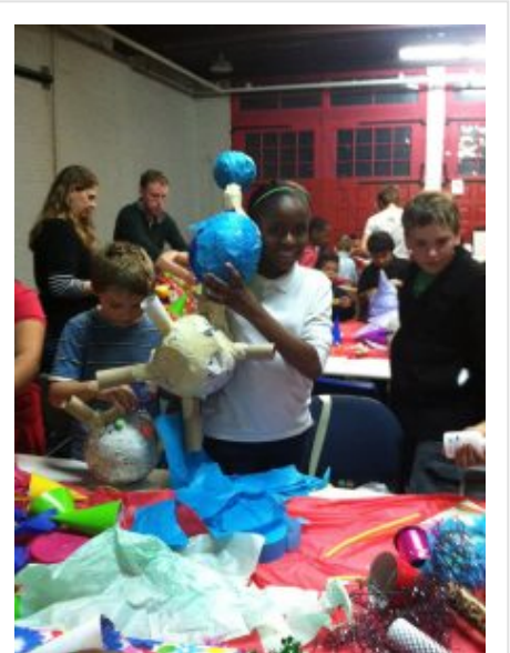
Making piñatas for Las Posadas

This is a cinematic profile of one of the most fascinating and eccentric personalities of the 20th century, a dynamic presence in the world of contemporary art who amassed one of the great private collections, of both art and artists.