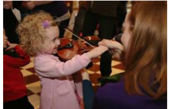
Macy's and ArtsWave share their annual arts sampler weekend, Saturday and Sunday.

Having just announced their 2017 campaign fundraising goal of $12.6 million, ArtsWave offers its weekend cornucopia of the arts, sponsored again by Macy's. Touching on every art form, the annual sampler delivers dozens of FREE arts opportunities across the region Saturday. Then the focus turns to downtown Sunday, with a day full of interactivity and performances at the Masonic Center and Taft Theatre.